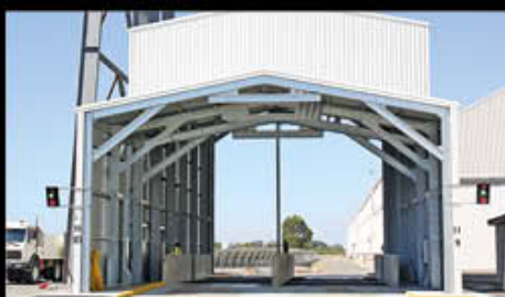
36) Wash Down Bay