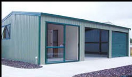
82) Double Garage & Office