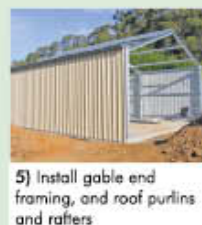
5) Install gable end framing, and roof purlins and rafters