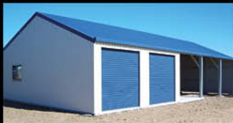
18) Farm Shed with Three Open & Two Enclosed Bays