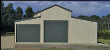
54) American Barn with Two Roller Doors