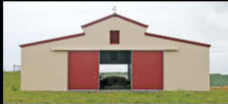
55) American Barn with Sliding Doors