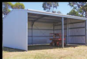
10) Open Front & Side Hay Shed