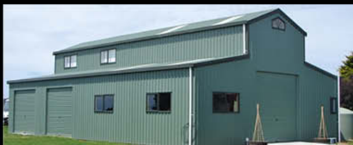
43) American Barn workshop and Garaging