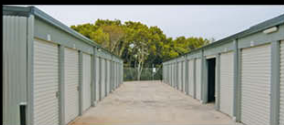
30) Commercial Storage Units