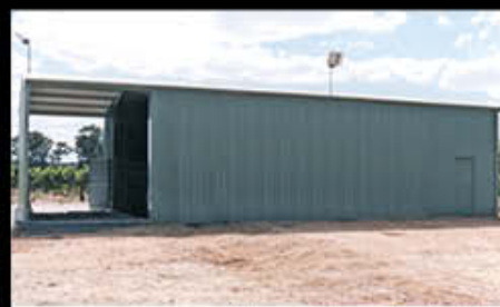
5) Large Farm Shed with Garaport