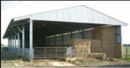
15) Large Hay Shed