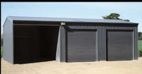
19) Farm Shed with One Open & Two Enclosed Bays