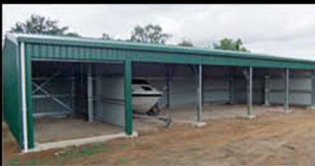
17) Farm Shed with Four Open & One Enclosed Bays