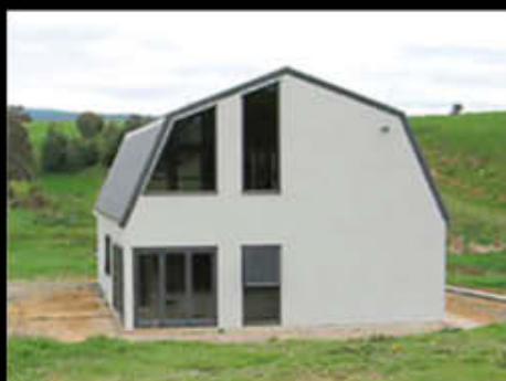
64) Customised Quaker Barn