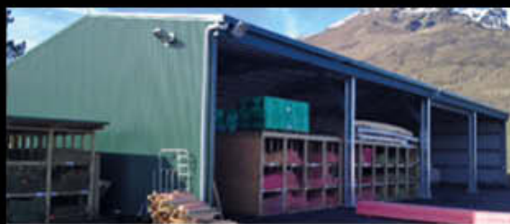
8) Open Four Bay Shed