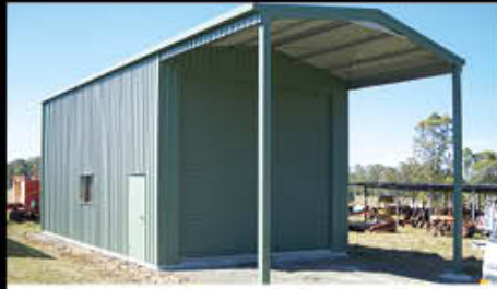
14) Tall Shed with Garaport