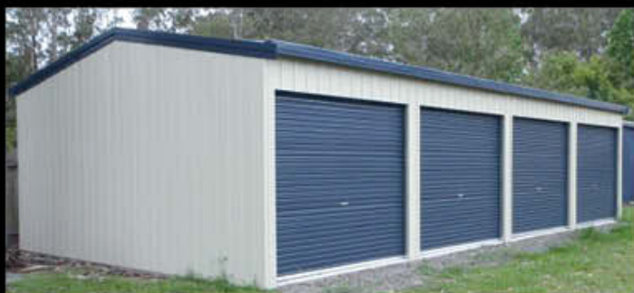
75) Multiple Car Garage

Genuine COLORSTEEL® cladding reassures you that your investment will look great for years to come. Simple design mixed with detailed instructions and specifications also means that a steel garage can be assembled by an experienced home handyman with a little help. A Fair Dinkum garage is the perfect addition to any New Zealand home.