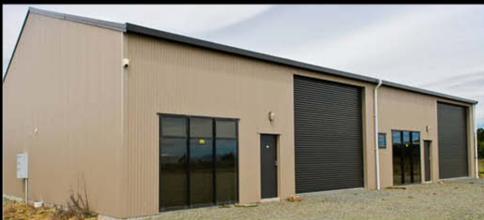
39) Customised Industrial Units