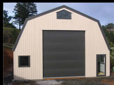
66) Quaker Barn with Large Roller door