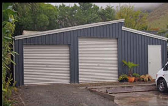
73) Skillion Roof