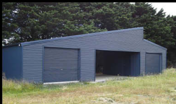
68) Horizontally Clad Skillion Barn with Internal Wall