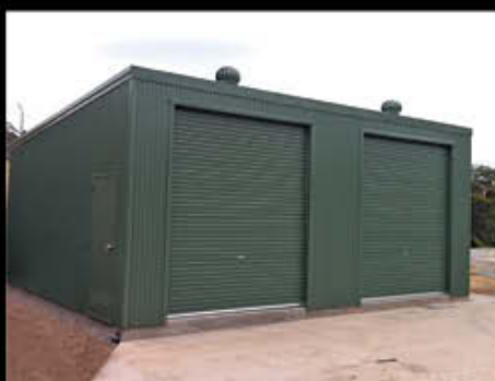
70) Skillion Garage