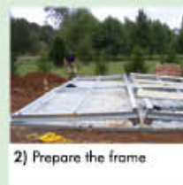
2) Prepare the frame