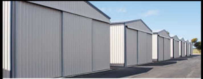
24) Small - Medium Hangers