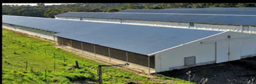
1) Large Farming Barn

All of our buildings are designed with the rugged New Zealand conditions in mind and with over 180,000 buildings already built around Australasia, you can rely on our capabilities.