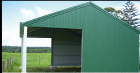
16) Open Front & Side Hay Shed