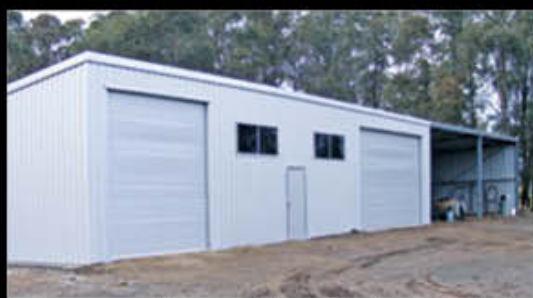
6) Custom Monopitch Farm Shed with Open Bays & Large Doors