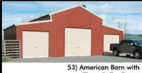
53) American Barn with Three Roller Doors