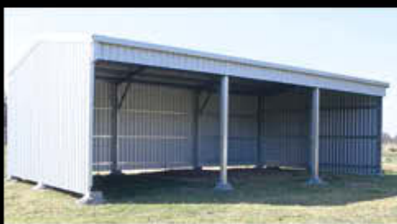
9) Open Three Bay Shed