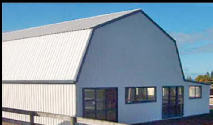
60) Quaker Barn with Closed-in Lean-to