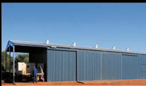
4) Large Farm Shed with Sliding Doors & Garaport