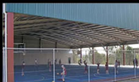
37) Covered Outdoor Learning Area (COLA)