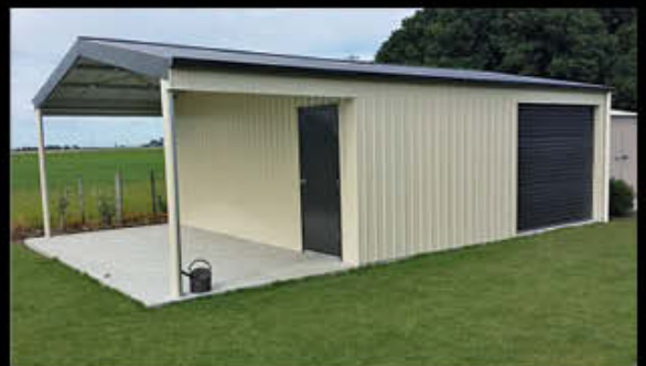
92) Garage with Garaport