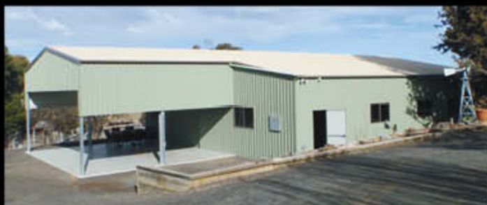
28) Custom Industrial Shed