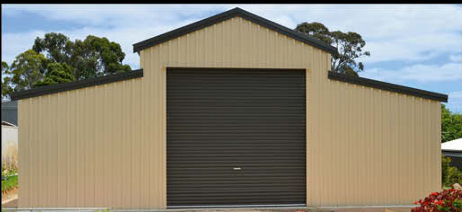
58) American Barn with One Roller Door