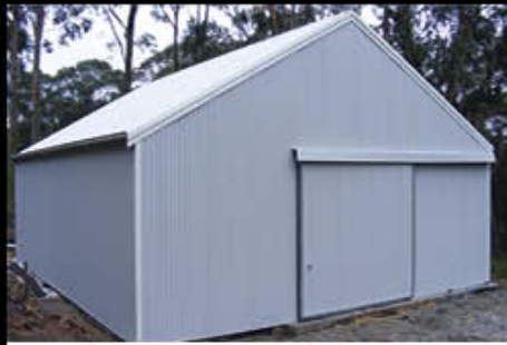
12) 30° Roof Pitch with Sliding Door