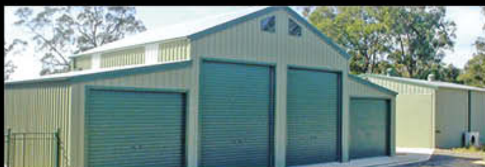
46) American Barn with Four Roller Doors