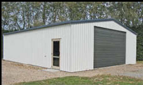
84) Large Single Garage