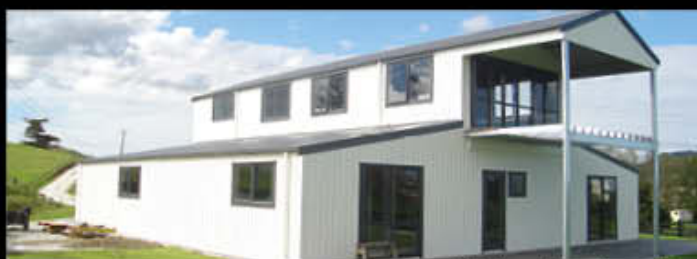
41) American Barn with Covered Deck