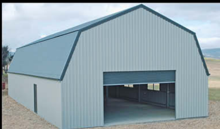
59) Large Industrial Quaker Barn

These unique designs make the most of upstairs space making them a practical solution for that holiday block, studio apartment or alternative living arrangement. These are also widely used as double garages with massive storage capacity.