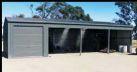
20) Open Farm Shed with One Enclosed Bay