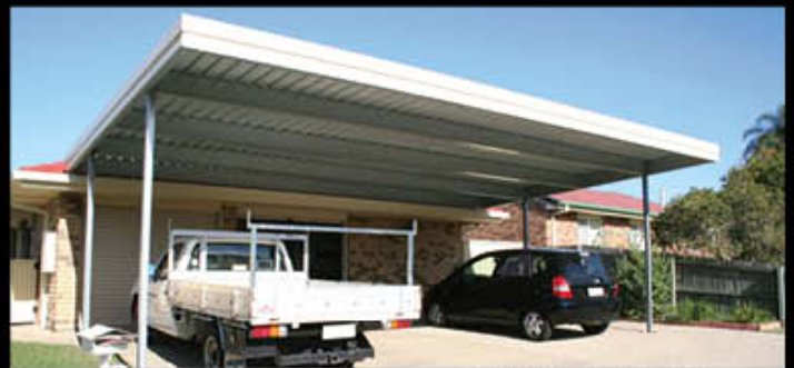
94) Triple Flat Roof Carport