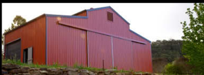
45) American Barn with Sliding Doors & Side Access