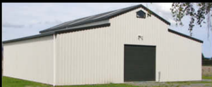
42) Large American Barn with One Roller Door