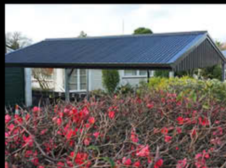
96) Single Gable Roof Carport with Gable Infill