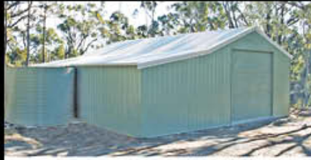
51) Split Kiwi Barn