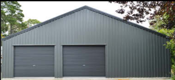
77) Large Garage & Workshop