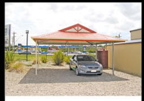
97) Large Single Dutch Gable Roof Carport