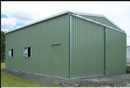
11) Tall Shed with Sliding Door