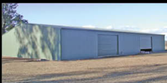
2) Large Machinery Shed