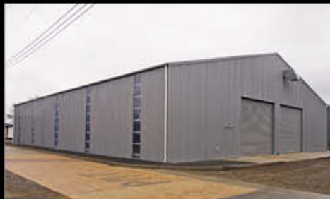
26) Large Industrial Shed