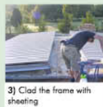
3) Clad the frame with sheeting