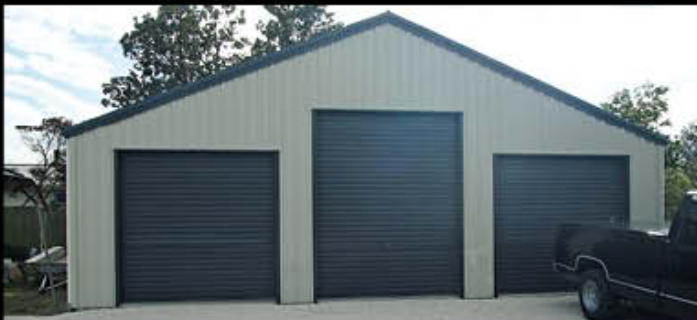
78) Triple Garage