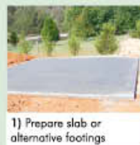
1) Prepare slab or alternative footings

For a more detailed guide, please visit www.fairdinkumsheds.co.nz/downloads