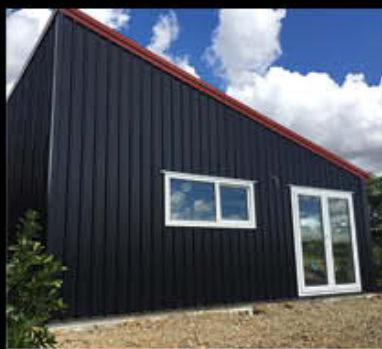
72) Skillion Workshop