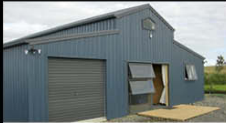
49) American Barn with Reception