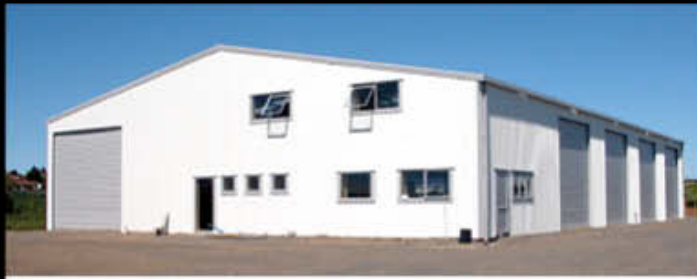
23) Industrial Unit with Mezzanine

Foundation systems can also be customised to suit your specific needs.