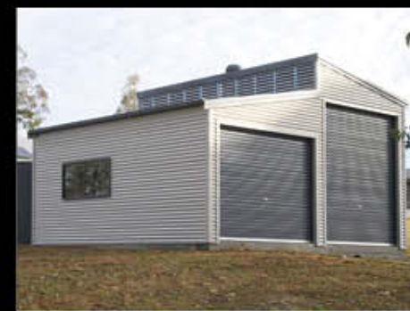
74) Skillion Garage with Lean-to