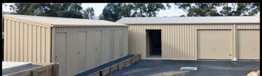
31) Customised Storage Units