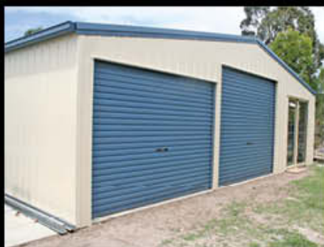
80) Triple Garage with Glass Sliding Door