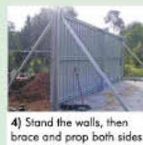
4) Stand the walls, then brace and prop both sides