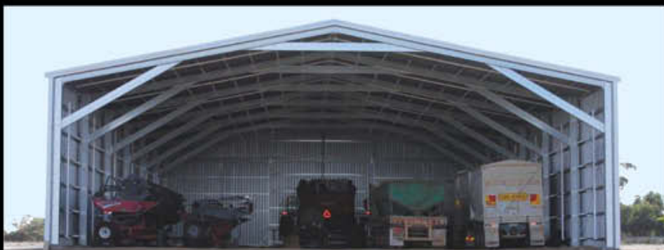
38) Large Clear Spans