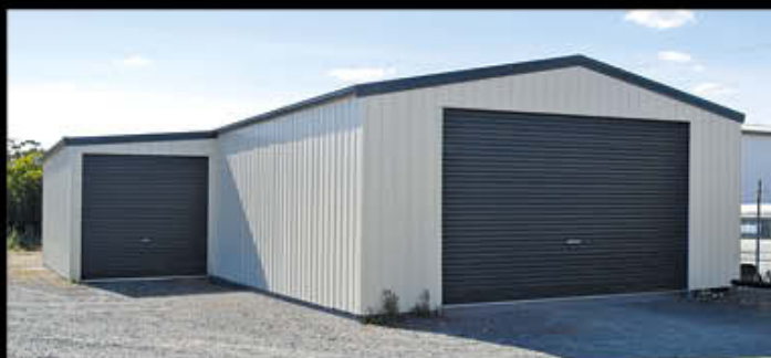
76) Large Shed with Enclosed Lean-to