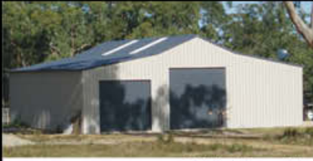
50) Kiwi Barn with Two Roller Doors