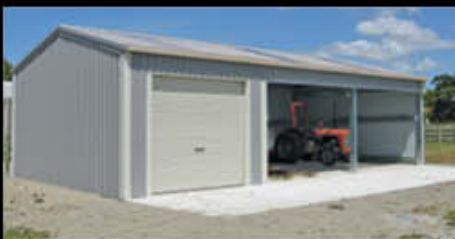
21) Farm Shed with Two Open & One Enclosed Bay