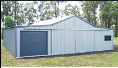
13) Sliding Doors