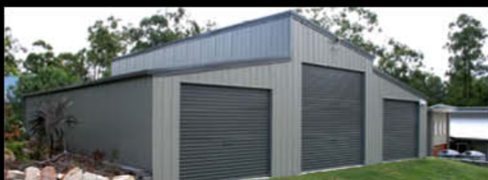
44) American Barn with Skillion Roof