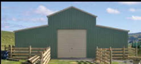
56) Stable Options