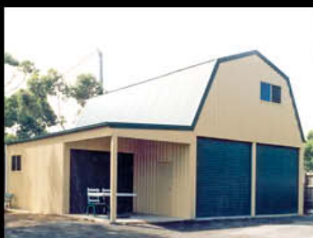
65) Quaker Barn with Annex