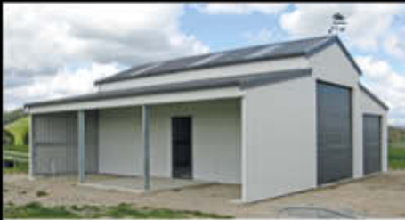
48) American Barn with Lean-to