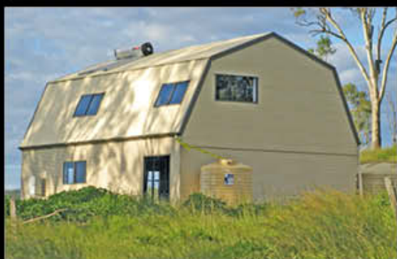
61) Quaker Barn with Horizontal Cladding