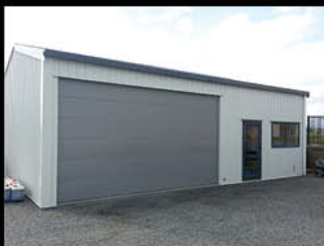
79) Garage & Workshop