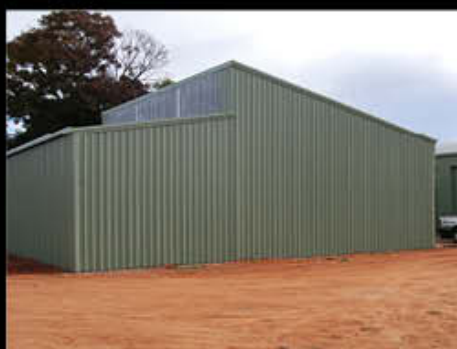
69) Skillion Garage with Lean-to