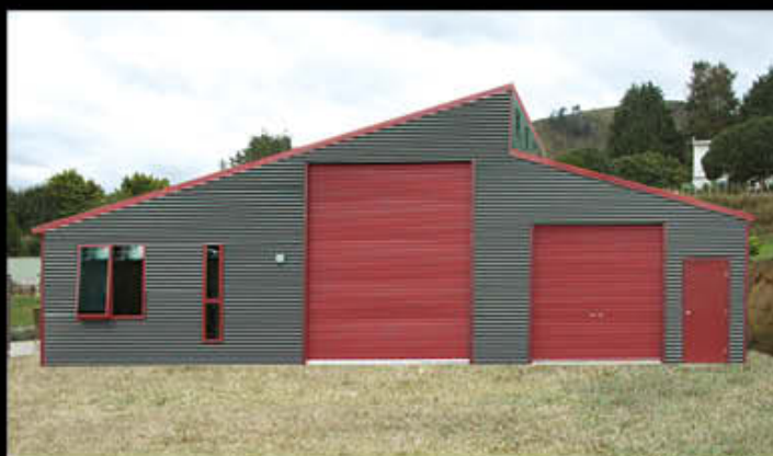
67) Skillion Roof Double Garage with Lean-to

A stunning angled roof better matches modern looking homes. Mix and match horizontal and vertical cladding and component colours for more pizzazz!