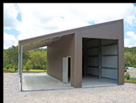
71) Oversized Industrial Skillion with Lean-to