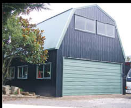
62) Quaker Barn with Vertical Cladding