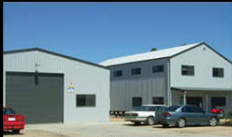
33) Industrial Unit & Office