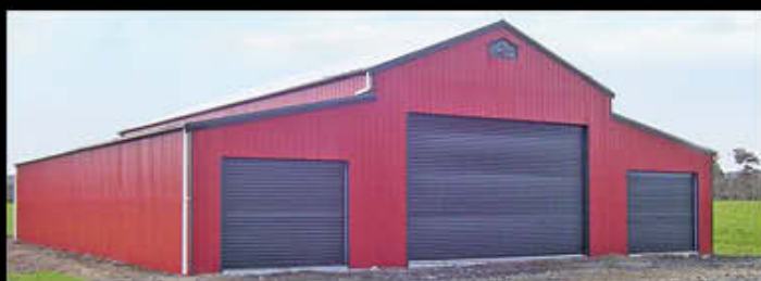
40) Large American Barn

You can easily personalise your barn with windows and glass sliding doors. We can even supply fly screens and security screens or window locks. To fully take advantage of the additional ceiling height, consider installing a mezzanine floor for use as storage or an additional workspace.