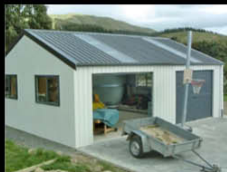
81) Home Workshop