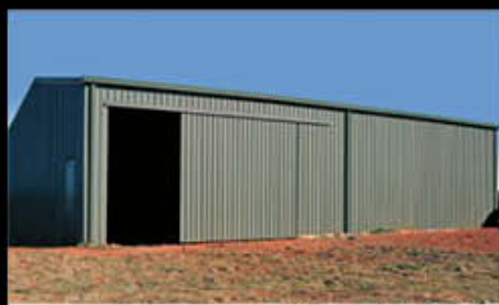
3) Farm Shed with Sliding Doors