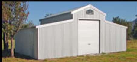
57) The Original American Barn