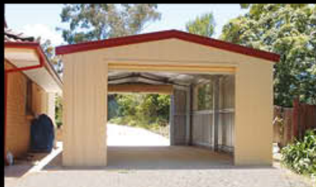
89) Single Garage with Roller Doors Front & Rear