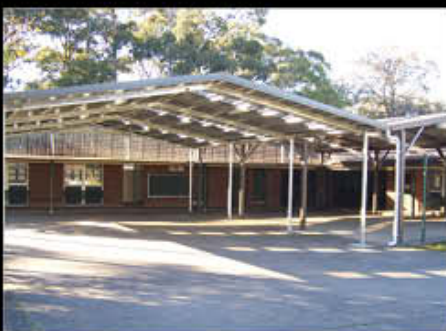
95) Gable Roof Awning