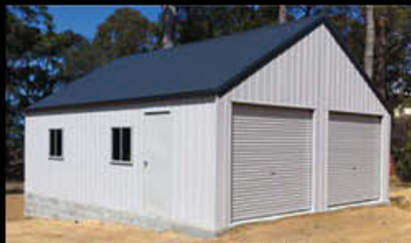
85) Double Garage with 30° Roof Pitch