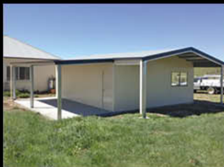
91) Garage with Garaport & Lean-to