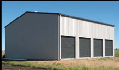
35) High Roof Multi-bay Shed