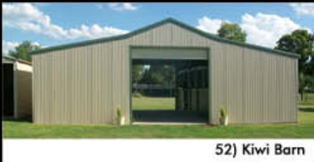
52) Kiwi Barn