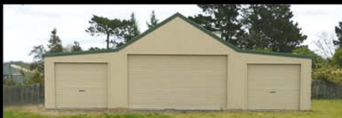
47) Kiwi Barn with Three Roller Doors