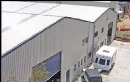
25) Industrial Units