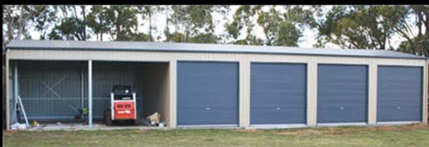
7) Farm Shed with Two Open & Four Enclosed Bay