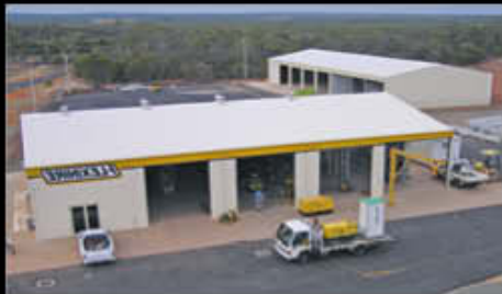
34) Industrial Complex