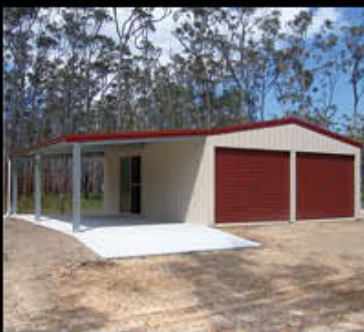
90) Double Garage with Lean-to

Garaport or Lean-to: Extend the roof area of your shed or garage to provide additional shade in the form of a Garaport or Lean-to. This is a great way to increase the energy efficiency of your building as well as increase the amount of protected space for a reasonable price. A Garaport is an extension of the Gable Roof side of your shed, whereas a Lean-to is an extension to the roofing on the side wall of the shed.