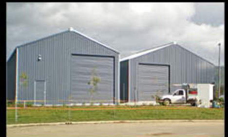
27) Industrial Unit Complex