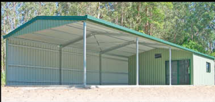
93) Semi-enclosed Garaport