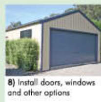
8) Install doors, windows and other options