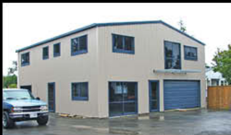
32) Industrial Office