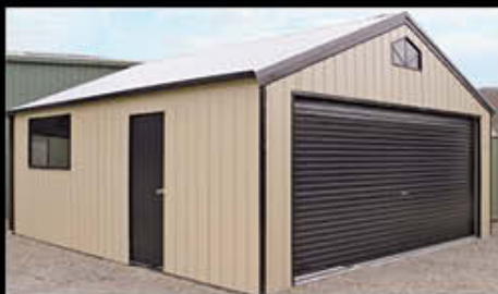
86) Double Deluxe Garage