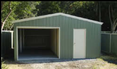
88) Double Garage with Internal Wall