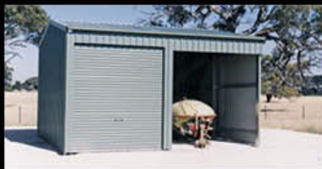
22) Farm Shed with One Open & One Enclosed Bay