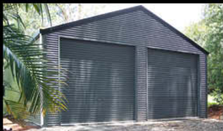
87) Double Garage with Horizontal Cladding