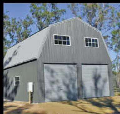
63) Quaker Barn with Double Roller Door