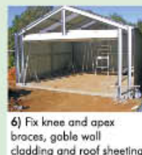
6) Fix knee and apex braces, gable wall cladding and roof sheeting