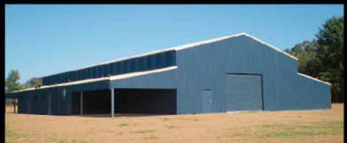
29) Industrial Shed with Open & Enclosed Lean-to