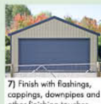
7) Finish with flashings, cappings, downpipes and other finishing touches