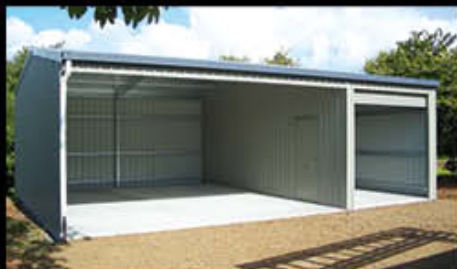
83) Open Bay Beam Over Shed & Garage